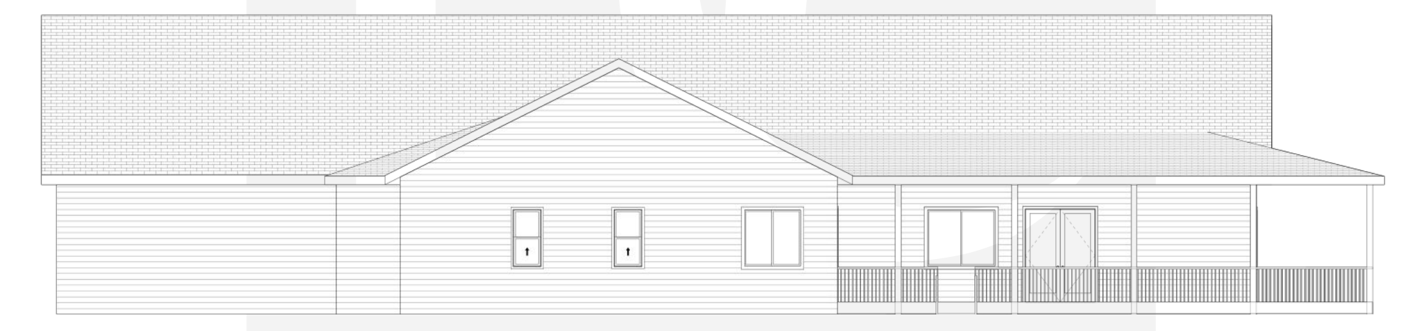
3,240 SQ FT. + 2,406 SQ FT. GARAGE 918 FATHER-IN-LAW SUITE