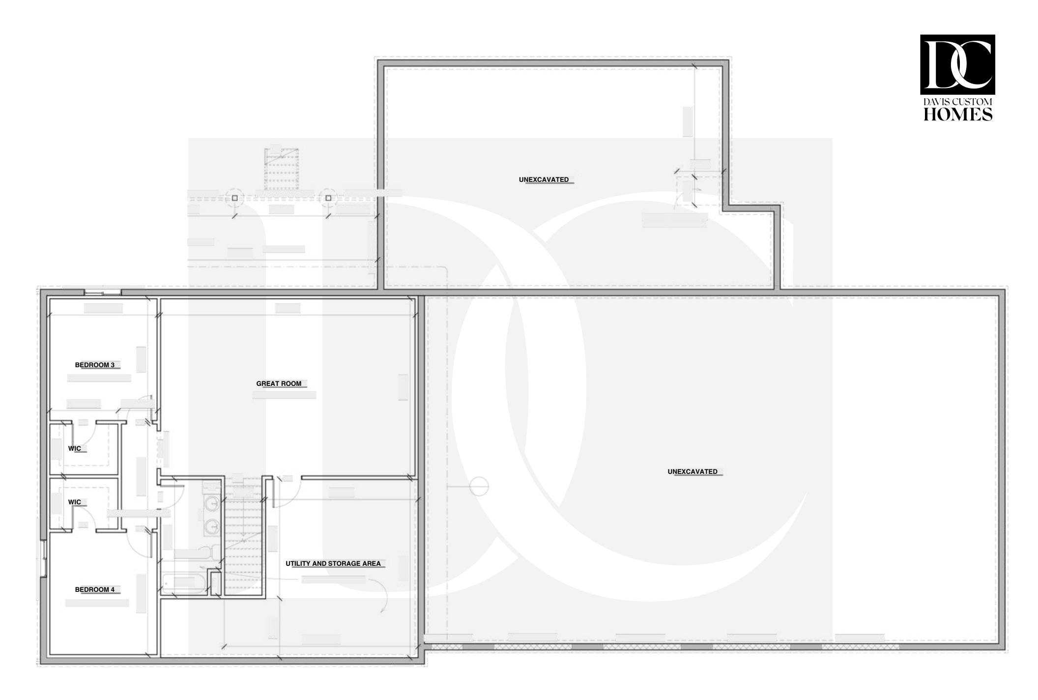
1,620 SQFT SECOND LEVEL