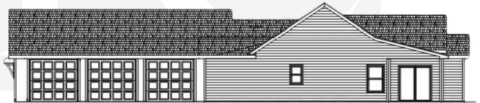
SIDE AND REAR ELEVATION