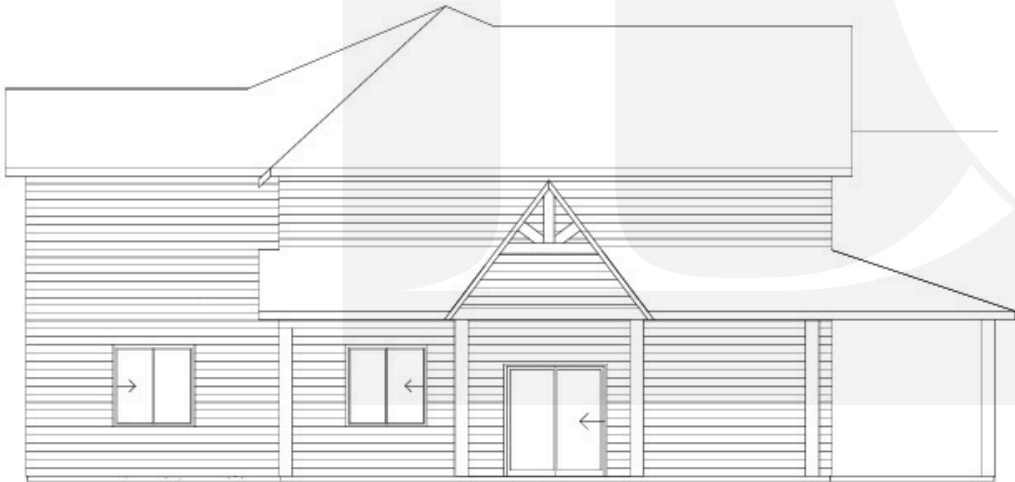
SIDE AND REAR ELEVATION