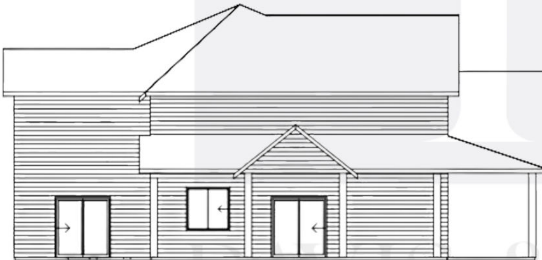
Side and Rear Elevation