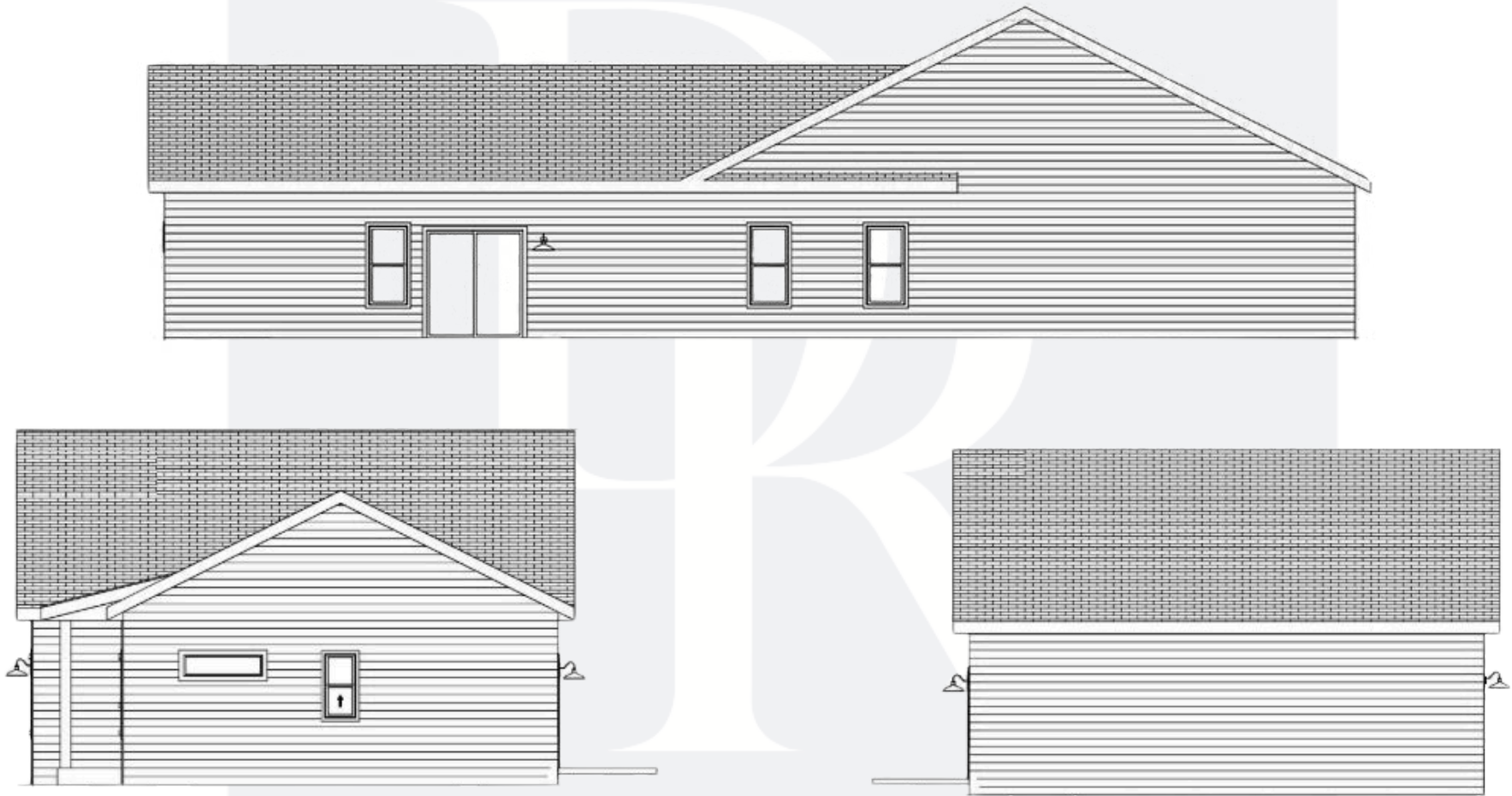
Back and Side Elevations