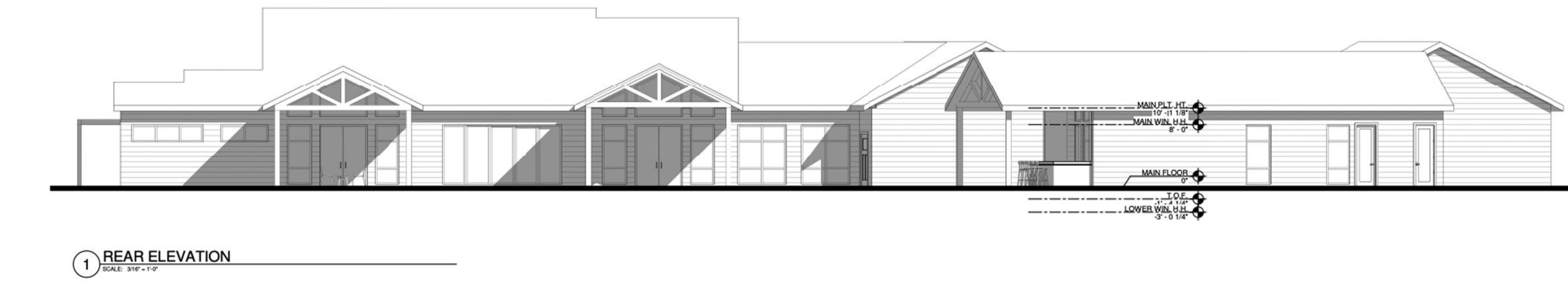
1 REAR ELEVATION SCALE 3/8" = 1'-0"