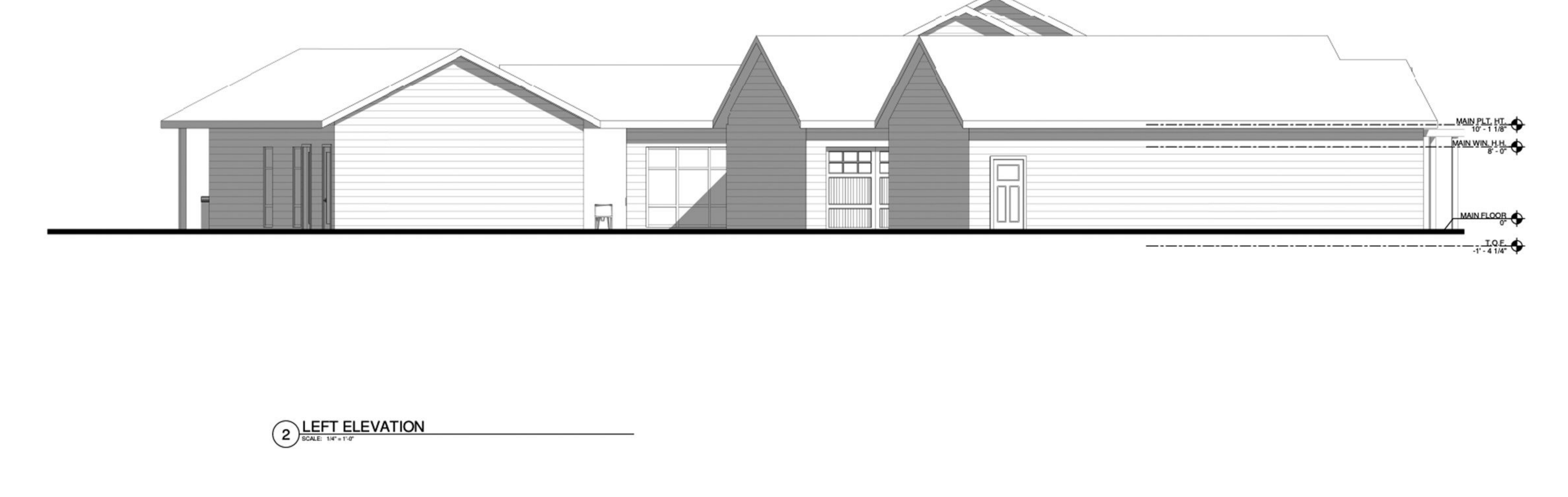
2 LEFT ELEVATION SCALE 3/8" = 1'-0"