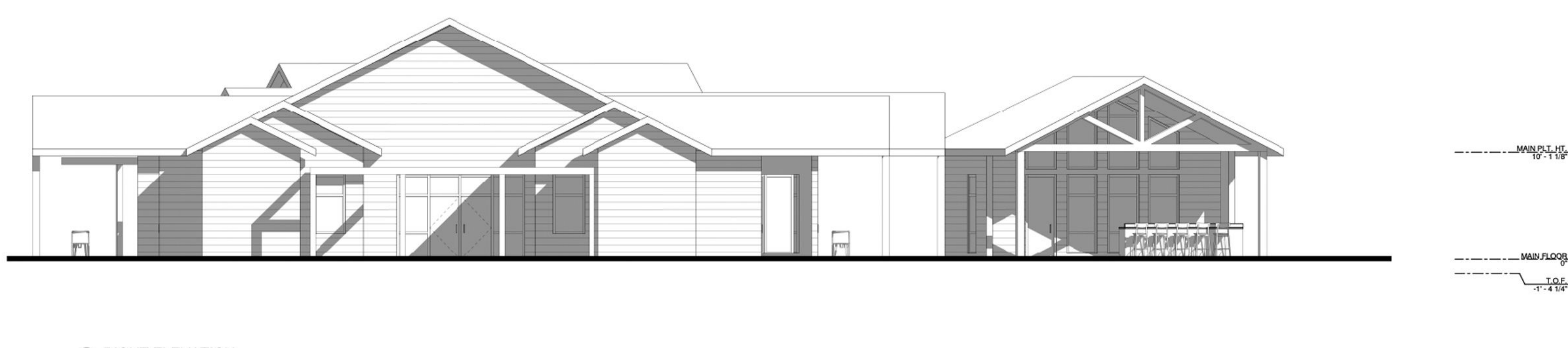
2 RIGHT ELEVATION SCALE 3/8" = 1'-0"